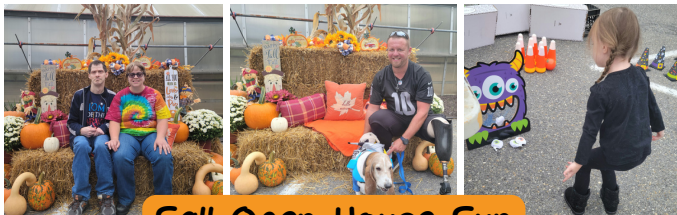
Fall Open House Fun